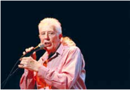
John Mayall at Seattle's Jazz Alley in 2014

Peter "Peetah" Morgan, Morgan Heritage Peter Sinfield, King Crimson Phil Lesh, The Grateful Dead Quincy Jones, Renaissance Man Randy Sparks, The New Christy Minstrels REO Speedwagon (Band retired the name