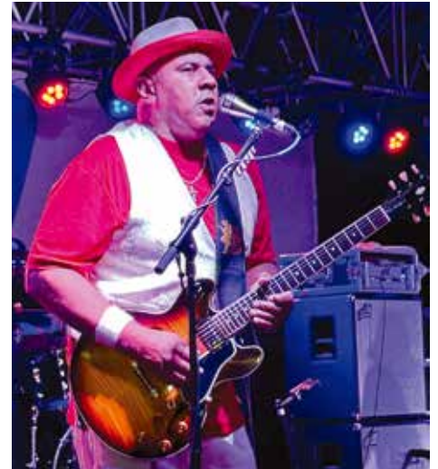
Ronnie Baker Brooks on the Blues Cruise!

Among the many lessons Ronnie learned growing up was to forge his own identity, to write his own songs, to play his own brand of blues and not to imitate anyone else. Willie Dixon taught him the importance of "delivering" the song, so the people know you