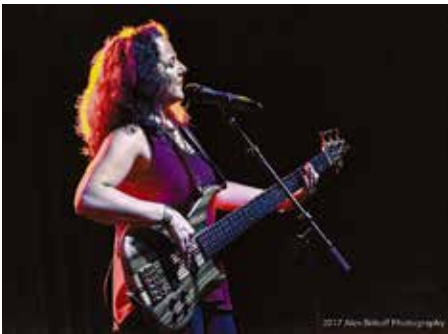
Top: Woman at Work (on Bass)