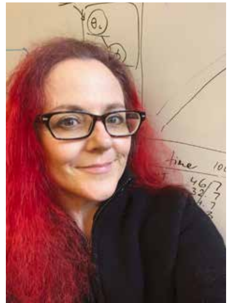
Woman at Work (In Her Day Job)

I keep my bass set up in my office in case inspiration strikes, but I don't get much time to play. I do write music almost every day. I do that while driving a lot, developing lyrics, thinking of arrangements, and listening to what other people are doing. There are gigs, although I can't work full-time gigging through this process. But on Fridays, I frequently get packed for a weekend show or two out of town, pairing boots with jeans and shirts, sorting jewelry out, getting my gear together and packing my computers so I can work on the road. I always intend to work on the road, but dang, it is difficult when traveling in a car with your two favorite people and cracking into the dissertation sounds like the least fun you could have. All too often, the computers stay packed.