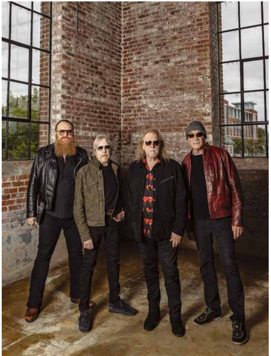
Ready for the 30 Years Strong Tour: Gov't Mule