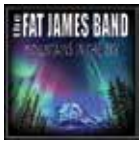
Fat James Band Mountains In the Sky (Self-Released)