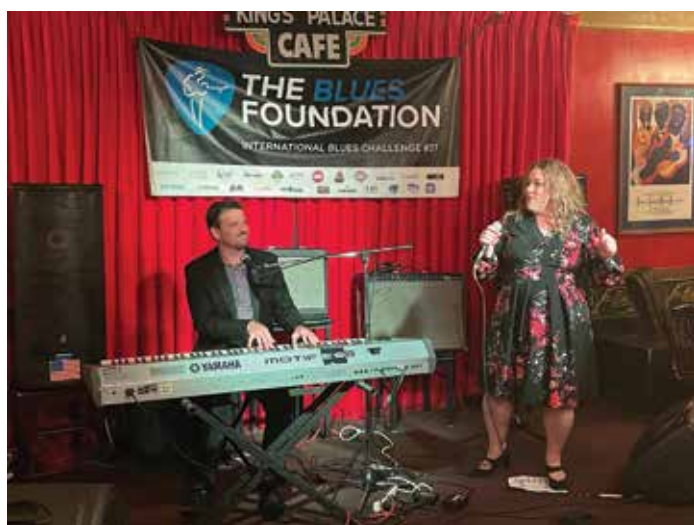
Upper Left: The Blues Foundation Wall