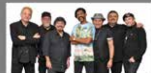
Billy Cobham Crosswinds Project Sept 13-14