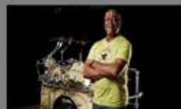
Lee Ritenour and Dave Grusin Sept 15-18