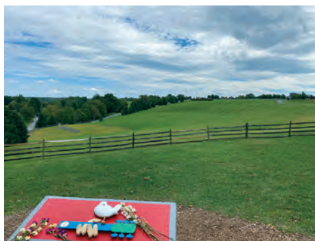
Looking Toward the Woodstock Stage

Entering Bethel, there's an expected “Welcome to Bethel” sign quickly followed by monuments, totems, VW bus shells, and art pulling for the peace sign of