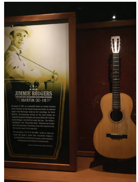
Jimmie Rodgers' Martin Guitar

Jimmie Rodgers influenced many seminal bluesmen, including Excelsior recording