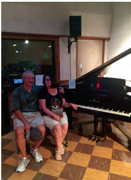
Our Hosts in RCA Studio B