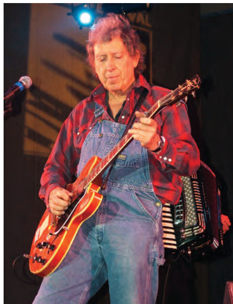
Elvin Bishop at the Chicago Blues Festival Welcome Elvin Bishop's Big Fun Trio to Jazz Alley This Month!