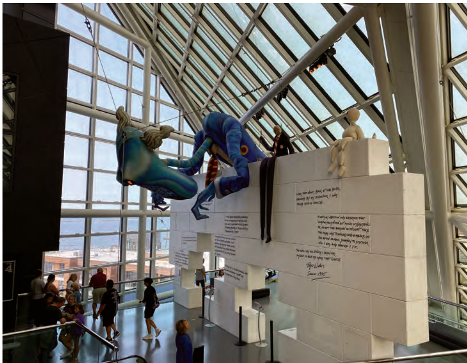
The Wall at the Rock and Roll Hall of Fame and Museum

I found myself thinking of connections to