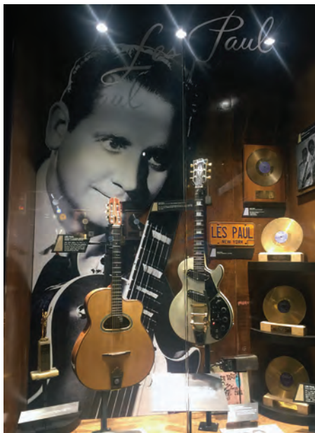
Les Paul: An Exceptional Legacy

Its checkerboard floor is complete with artists' "marks" in colored gaffer's tape showing each musician where to stand for optimal tone. The Studio is also filled