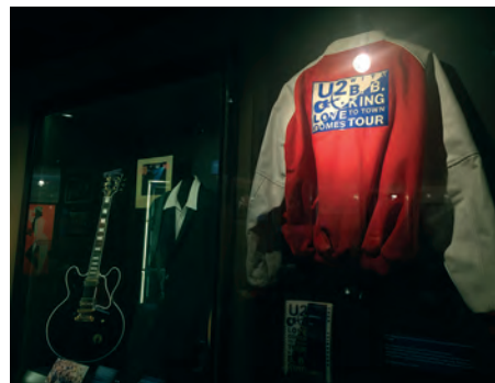
B.B. King's Suit & Bono's Jacket at The Blues Hall of Fame

Third Man Records is another Mecca of artistry as Jack White of the White Stripes provides a record store, live recording