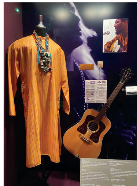
Richie Havens' Exhibit at the Woodstock Museum

The Museum at Bethel Woods sits atop the high ridge seen in the movie from the stage. It would probably take five hours to see each exhibit, Kevin told me it easily could be three times larger to display all the items from the festival. Songs naturally play throughout the exhibit with kiosks for more intimate 1:1 listening experiences. Displays range from an old wood wall where fans scratched their names into