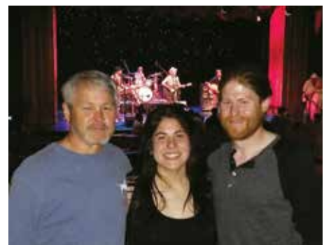
Left: Before the Show!