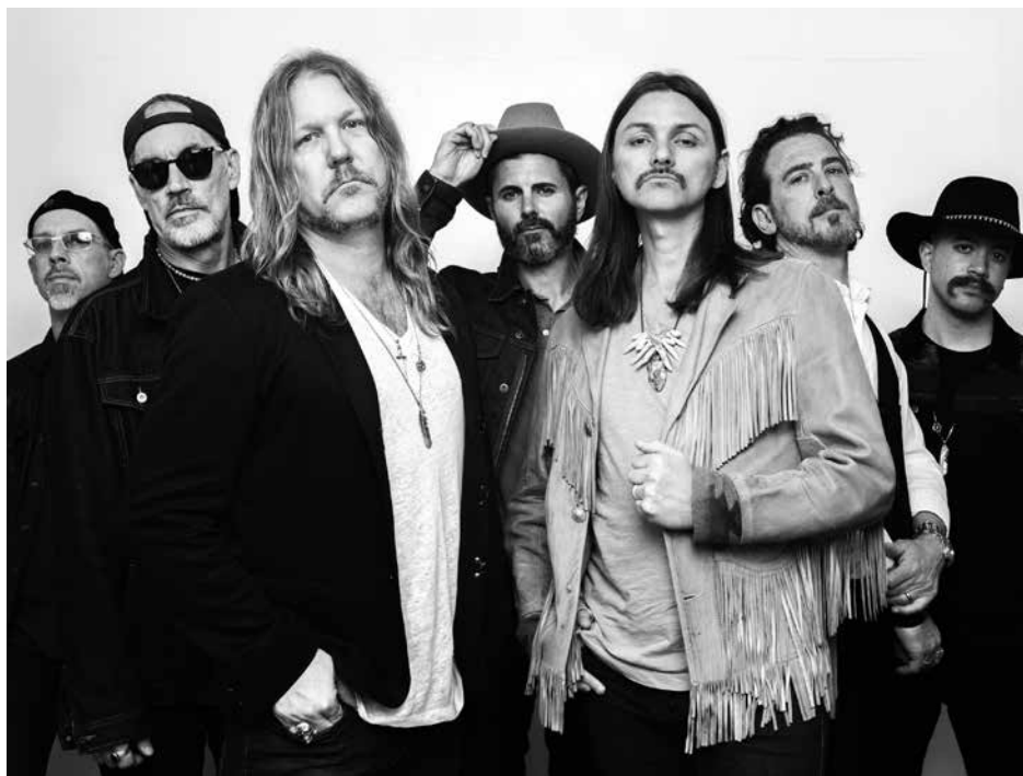
The Allman Betts Band

It's hard for a writer to revisit the topic of a previous article. Timeliness, covering old ground, fads running out of life. Once the article's published, it's time to move on to the next one. To be future-focused and improve upon past published work.