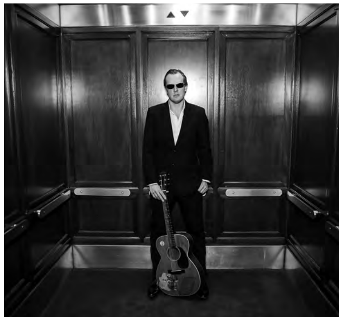
Joe Bonamassa at Carnegie Hall

The Band Together: Small Business Relief Concert Series. Beatnicks 6 PM https://www.facebook.com/