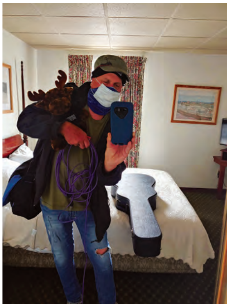
Above: Bluesman's Ready. Below: A Real Griz.