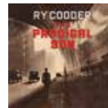
Ry Cooder The Prodigal Son (Perro Verde Records/ Fantasy Records)