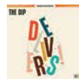
The Dip Delivers (Self-Released)