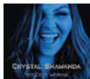
Crystal Shawanda Voodoo Woman (New Sun Records/True North Records)