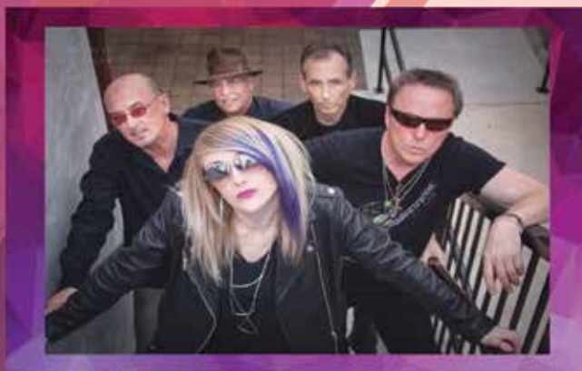
THIRD TRAIN RUNNING