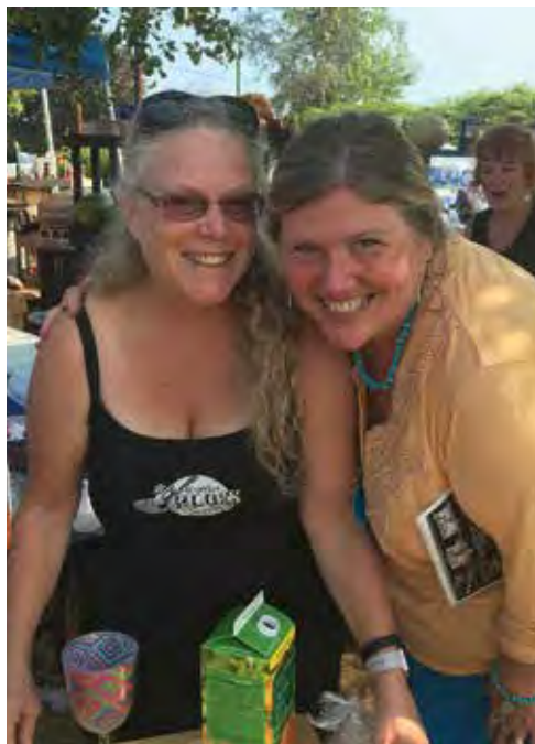
Our Volunteer Director & Music Director at Freedom Fest!