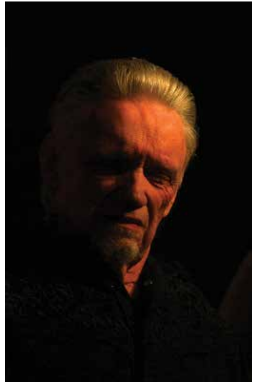
Little Bill (Above: Photo by Blues Boss, Lower Left: Photo by Alex Brikoff)

Within about a month, it found its way onto the national charts and settled in for a respectable six weeks. When it fell off, it left a nineteen-year-old kid about to embark on a long trip back.