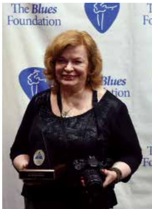
KBA Photographer Suzanne Swanson