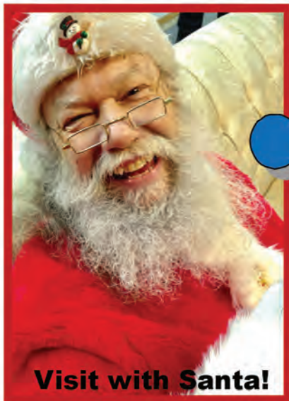
Visit with Santa!

All Adults are Invited to our new Blues Bash home: CappsClub.com