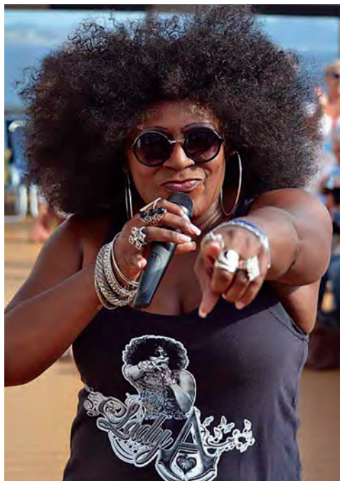
Lady "A"