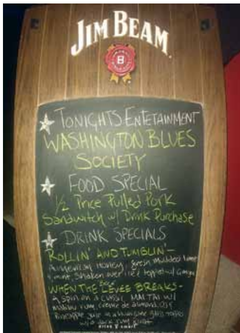
Menu Specials at Our Monthly Blues Bash!